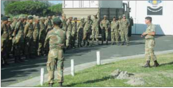
The infantry reserve at Fort iKapa, Goodwood, is looking for former members of the defence force.