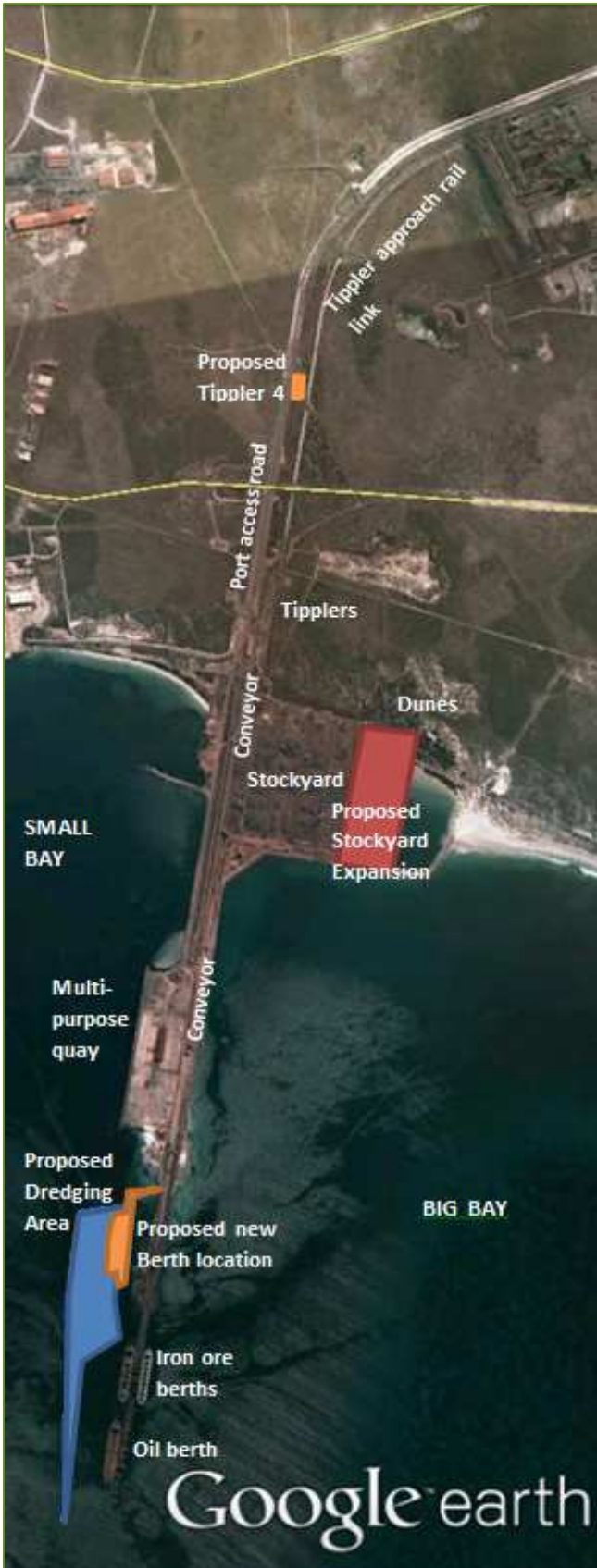
Figure 7: Aerial Map of the Port of Saldanha