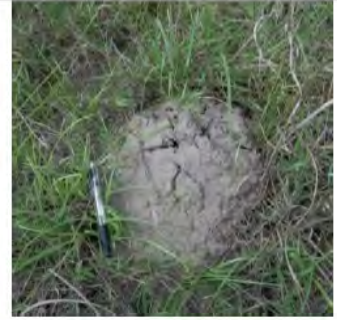
Evidence of Molerat ( Cryptomys hottentotus ) activity