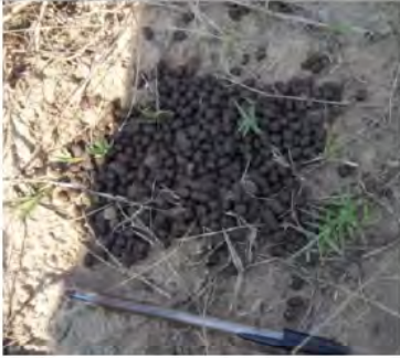
Common Duiker ( Sylvicapra grimmia ) droppings