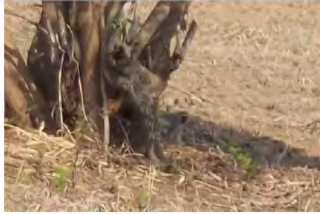
Vervet Monkeys ( Cercopithecus aethiops )