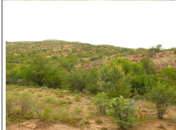
Top left: existing track to hard rock quarry location. Top right: looking north at the proposed hard rock quarry location. Bottom left: proposed mining face where quarrying may start. Bottom right: view towards the left side.