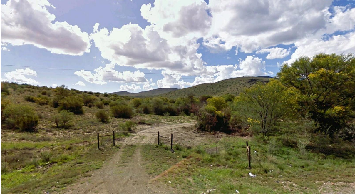
Entrance to the proposed hard rock quarry

HRQ 1 - Fairview (Raasfontein RE/2/152) 39.1 km from the Cradock R61 turnoff